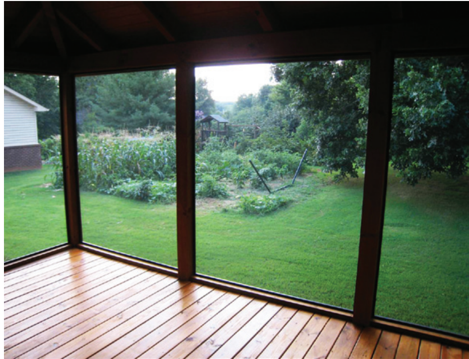
View of the garden area from the 7-by-5½-foot MINI Track™ porch screening system from Screen Tight™.