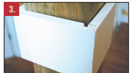
3. Snap into place

FOR MORE INFORMATION AND A FREE SAMPLE, CALL 1-800-768-7325