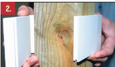
2. Place Wrap n’ Snap around wood column